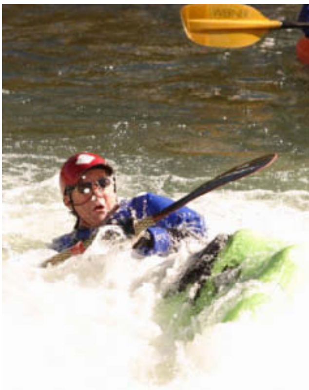
A kayaker enjoys a run down the Truckee River.